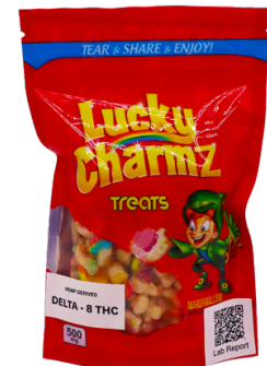
TOP 5 WHOLESALE 27

"In around 3% of people, THCO produces very powerful, almost psychedelic effects. For the rest of the 90%, it's ...very strong and potent..."